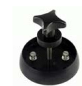
Trixy, Bowl adapter