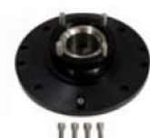
Trixy, Mitchell adapter

There are multiple ways to control the Trixy Remote Head.